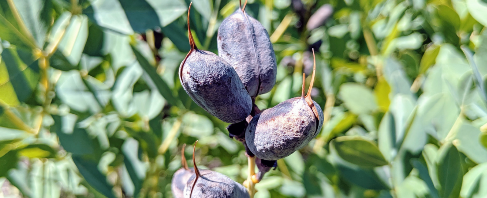
After flowering: wild indigo, prickly dianthus