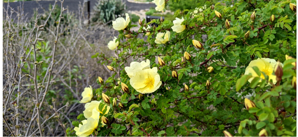
Rosa 'John Cabot' rose