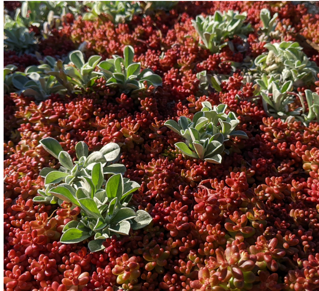
Firewise ground covers: Veronica lizanensis , hardy Sedum album with native Antennaria