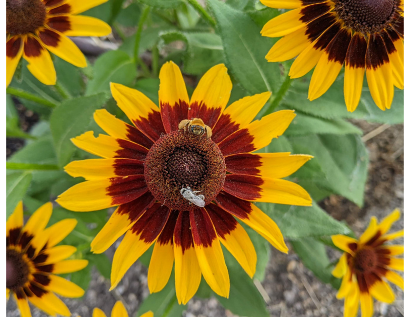
Plant Select® Idaho Firewise Garden - landscaping for steep slopes