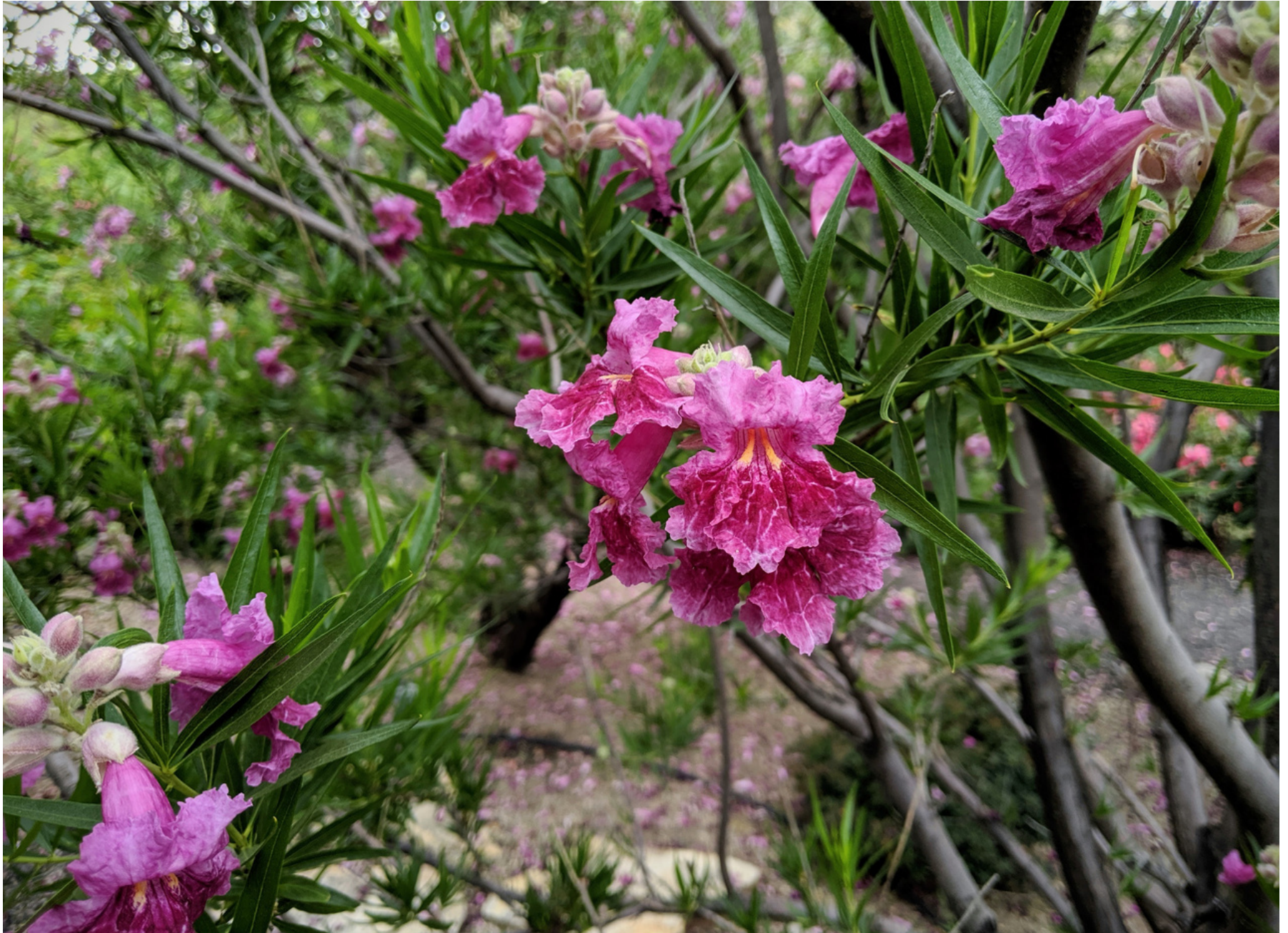
Chilopsis linearis , desert willow