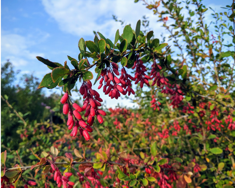
Pectin content - firewise landscaping