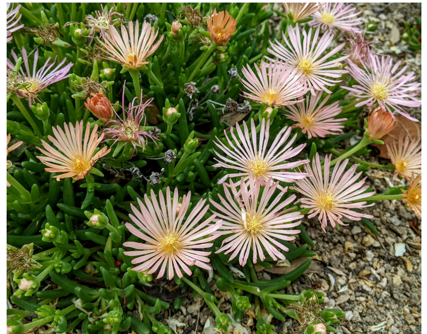
Delosperma spp., hardy ice plant