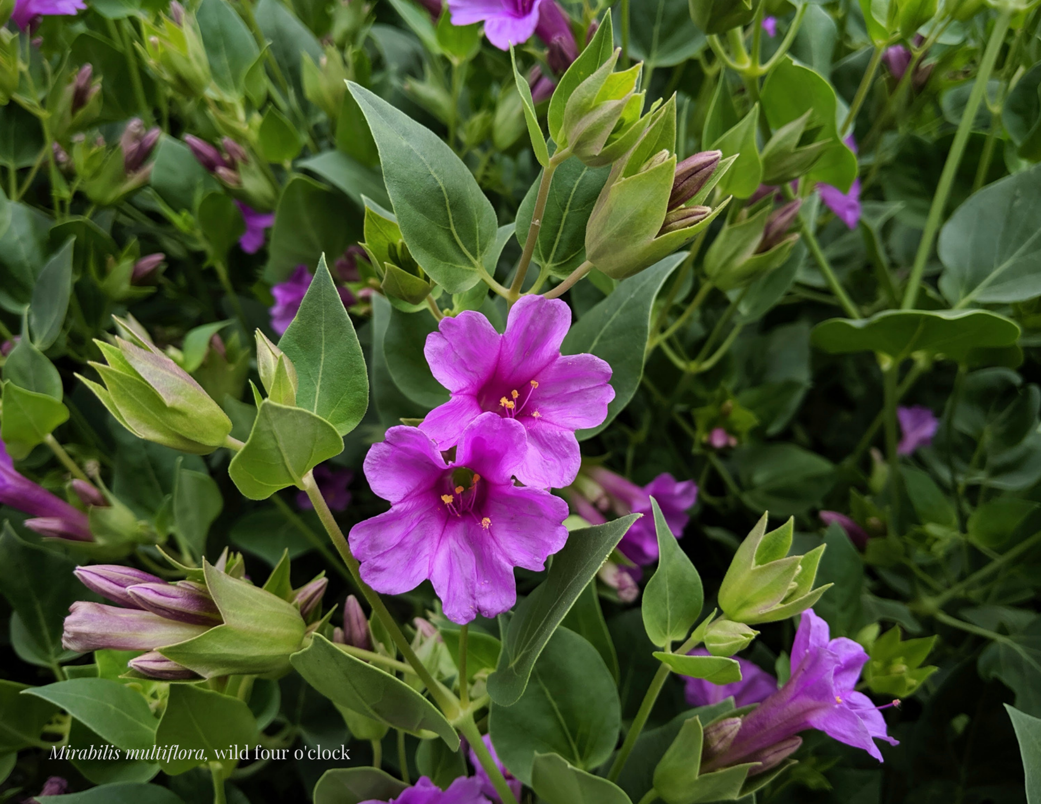
Mirabilis multiflora , wild four o'clock