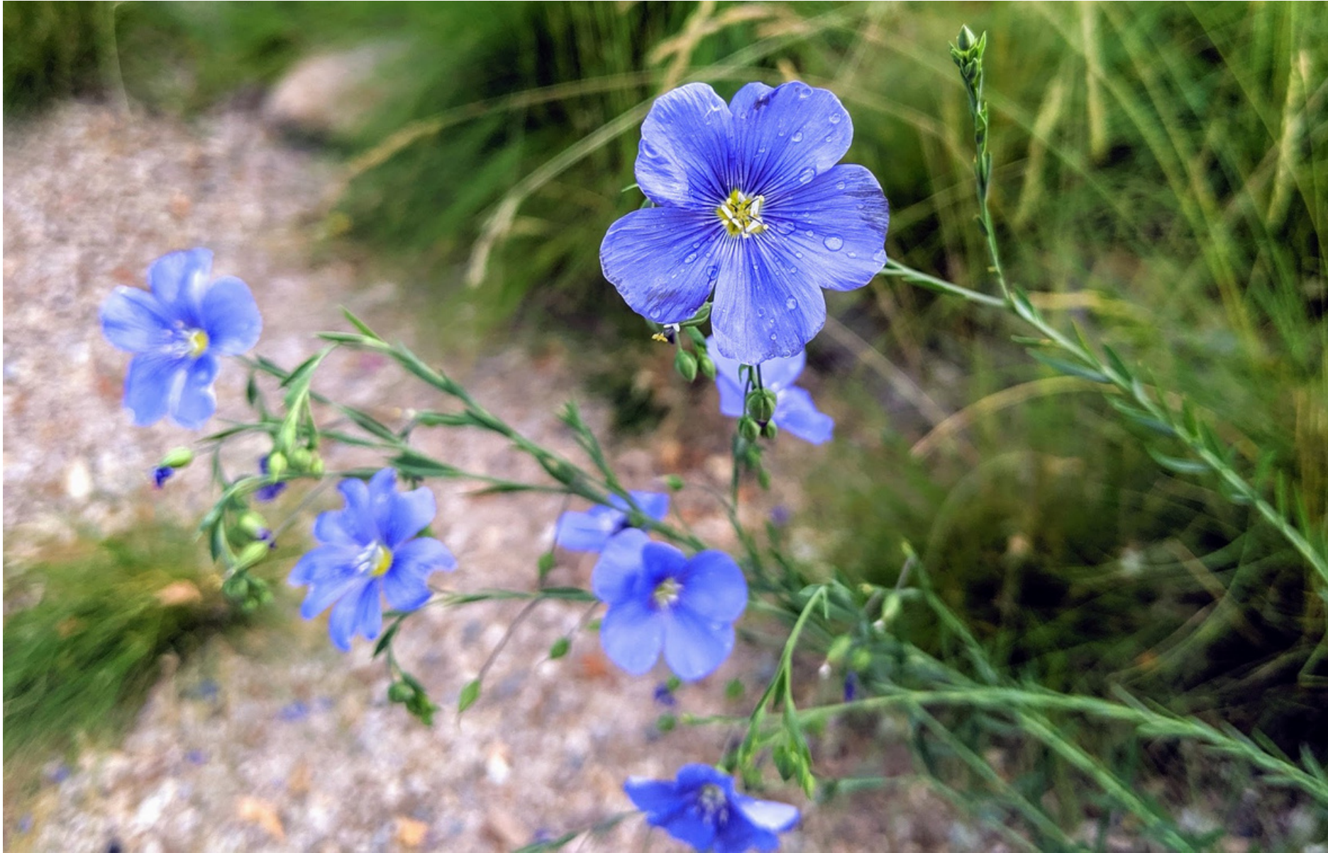
Linum , blue flax