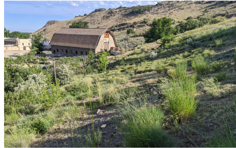
Foothills restoration and fire prevention efforts