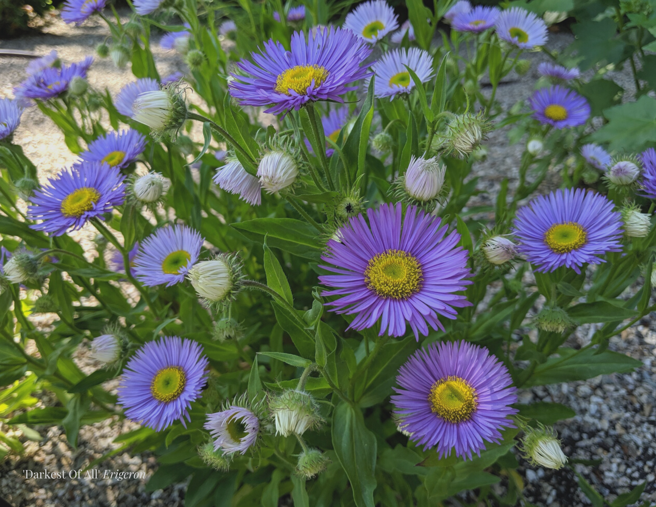
'Darkest Of All' Erigeron