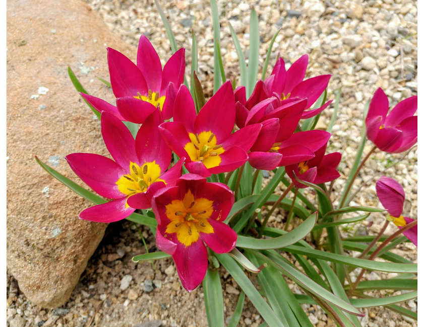
Spring flowering bulbs