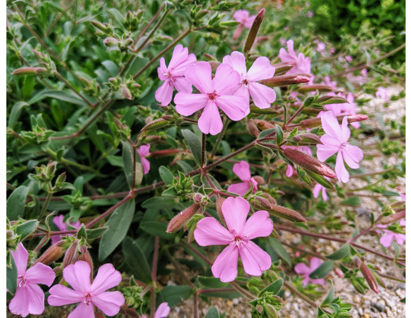
Firewise perennial combination: Rocky Mountain penstemon, pineleaf penstemon, sulphur buckwheat, giant flowered soapwort