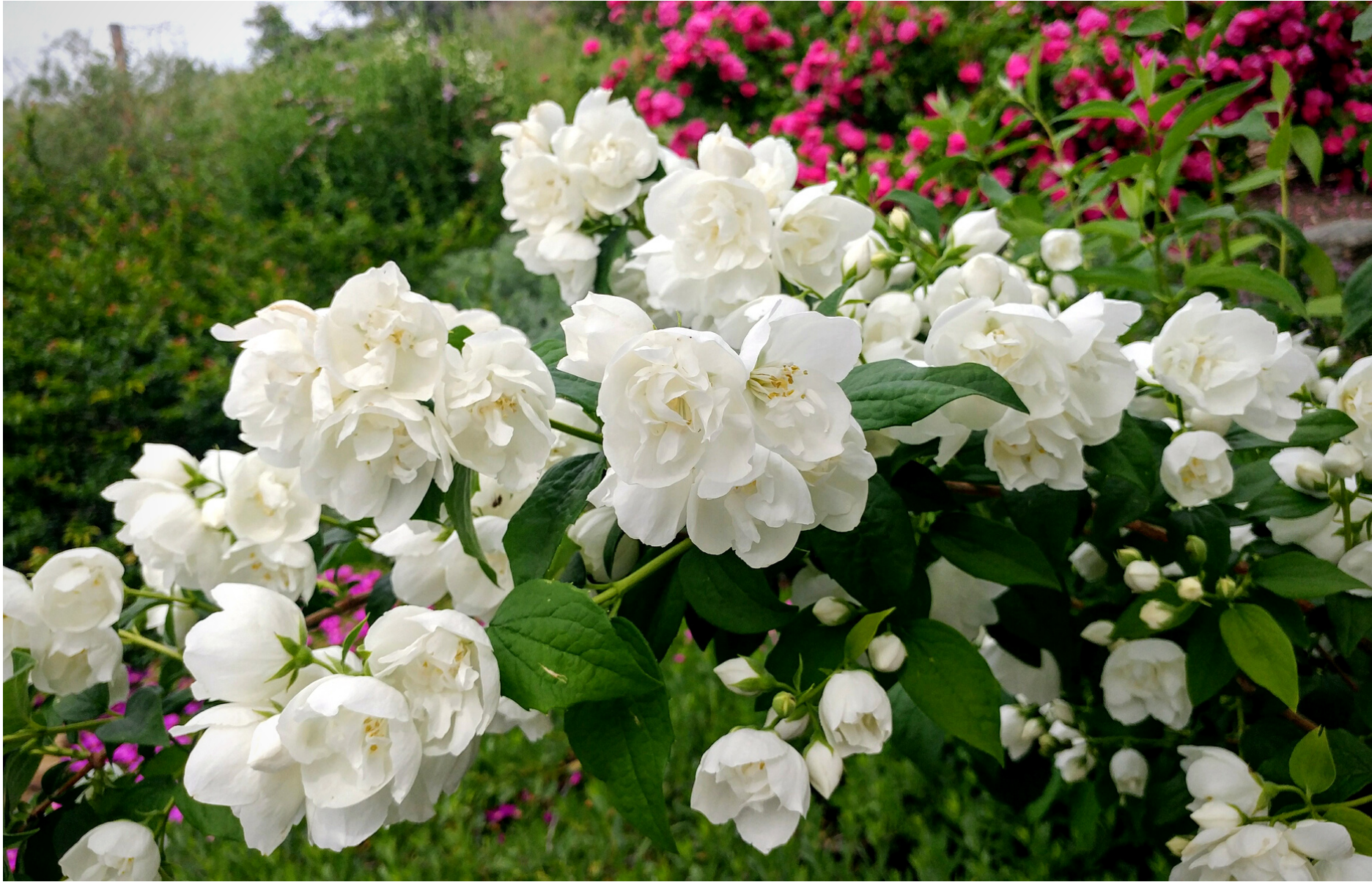
Philadelphus spp., mock orange